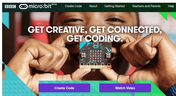
Figure 2: Official website with resources

asked to register with the BBC to request one free micro:bit per eligible child plus devices for their CS teachers. In September a small number of prototype micro:bits were made available to partners and selected teachers for trial and training purposes. A range of events were offered to train teachers. From March 2016, schools started to receive devices for teacher familiarisation and most schools received their full delivery between April and July 2016.